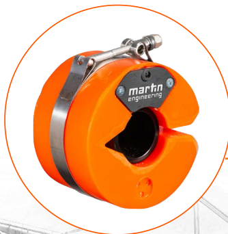
N2® Position Indicators