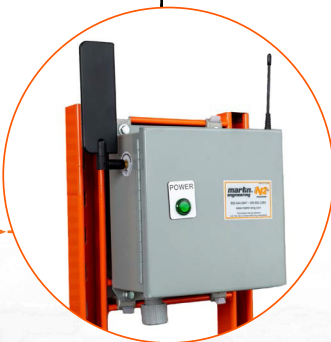
N2® Cellular Gateway