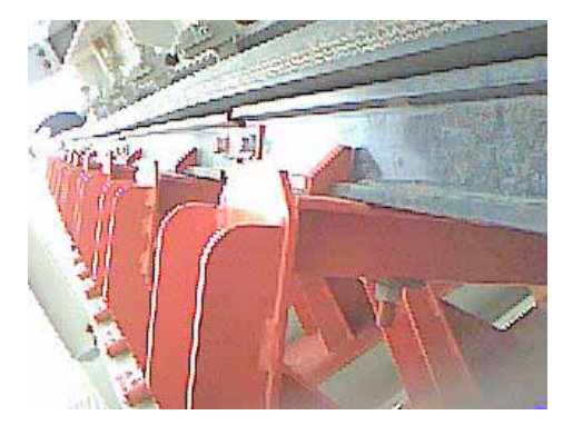
New conveyors at a Peruvian gold mine include modular, slide-in cradles to support the belt.

LOCATION: Newmount Mining Corporation Mineria Yanacocha Mine, Peru