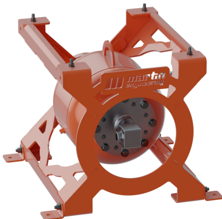
AIR CANNON X-STAND AND TYPHOON AIR CANNON P/N A50009T-XXXL-AT*

The X-Stand was designed to provide a sturdy, reliable, and secure mounting solution for air cannons. It gives customers the flexibility to mount cannons onto a safe, stable structure while maintaining all the performance benefits of air cannon technology.