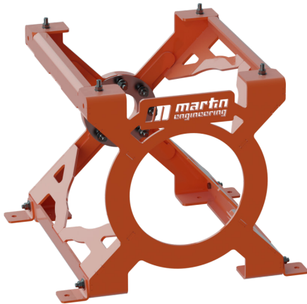
AIR CANNON X-STAND ONLY P/N A50009T-XXXL-H*