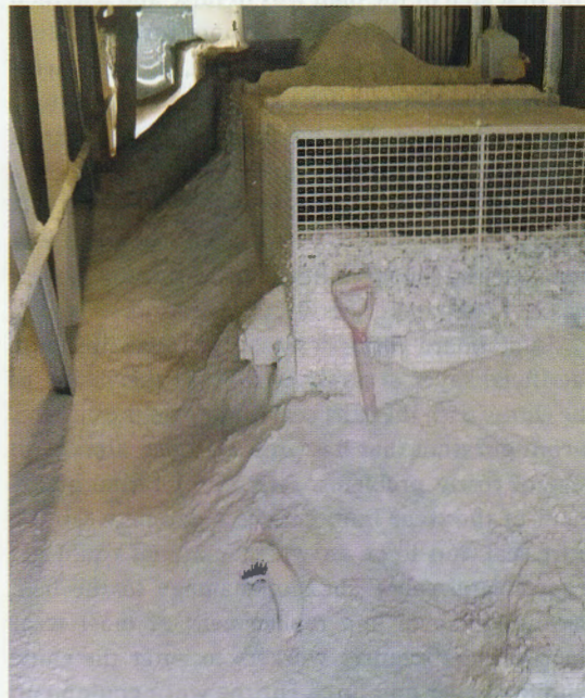
1 Piled high enough to encapsulate the tail pulley and belt, the dust was a serious problem

Singleton Birch initially brought in Martin Engineering for conveyor training of 10 employees using its Foundations program and reference book. Now in its 4 th edition, the 574-page volume teaches basic and advanced level conveyor system maintenance and safety. As part of the hands-on program, instructors took students on a walkthrough and created a report for several conveyors in the plant, including the GLC1, where points of poten-