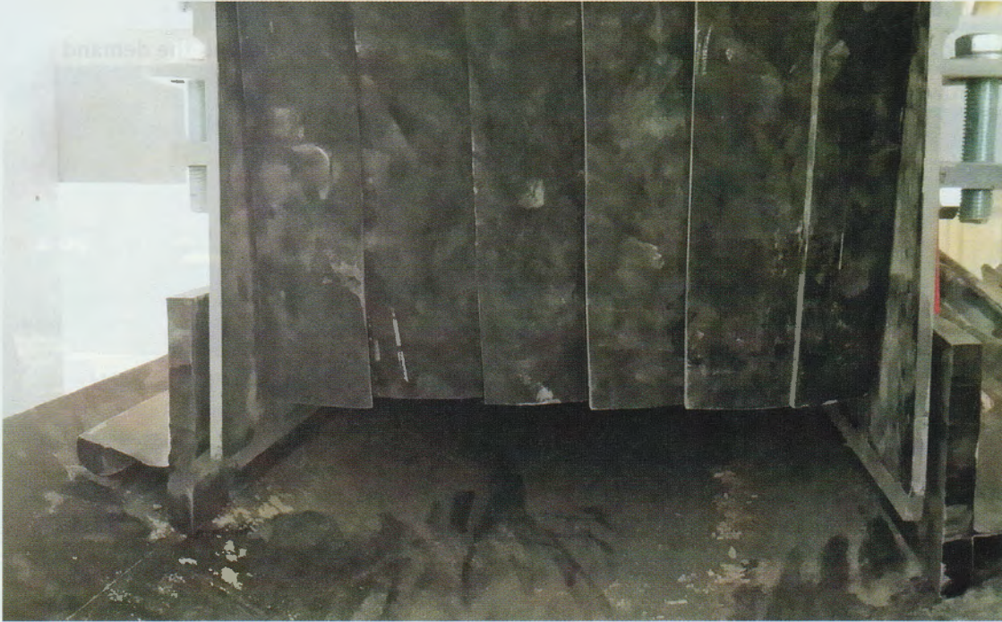
3 Dust curtains are set throughout the chute to slow air flow and reduce fugitive particle emissions

“When we turned the system on with a full volume of material being loaded onto the belt, there was some confusion at first from the person over the intercom as to whether the system was operating, since there appeared to be no dust,” Kevill recalled. “Even after nearly a year of operation, the air inside of the enclosure is clear enough to see down the entire length of the shaft.”