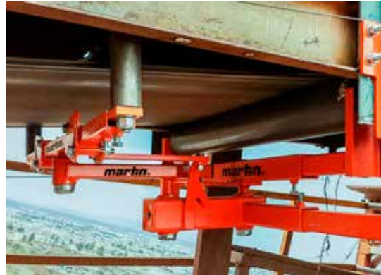
4 Multi-Pivot Trainer for the return run

“While these mechanisms can improve a belt that’s consistently off-center in one direction, they do not react to dynamic belt movement, meaning that they don’t correct intermittent belt wander,” Marshall continued. “To combat such changing conditions, engineers designed the tracking idler. Unlike the edge correction approach, the device senses belt movement in either direction, and pivots the idler slightly to steer the belt back into position. It doesn’t apply a great deal of force to the edges, which can damage a belt and splices. When the belt is running true, it remains centered, and when it senses a misaligned condition, it gently corrects the belt.”