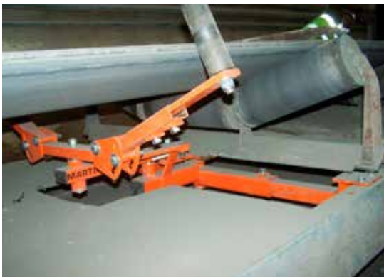
3 Multi-Pivot Trainer for the load-carrying run