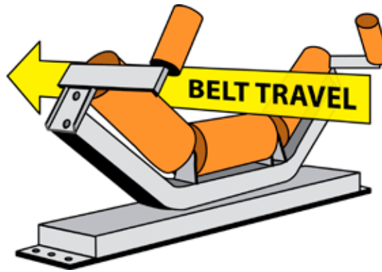
2 Tracking idler