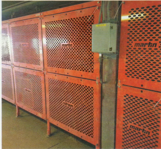
All Martin Engineering

Conveyors are among the most dynamic and potentially dangerous equipment in bulk handling. The operational basics of belt conveyor systems regarding the hardware installed and the performance required from the components are too often a mystery to many employees. This knowledge gap also creates a safety gap. Since personnel are the single most important resource of any industrial operation, to meet workplace safety standards, the consensus among safety professionals is to design the hazard out of the component or system, which historically yields more cost-effective and durable results.