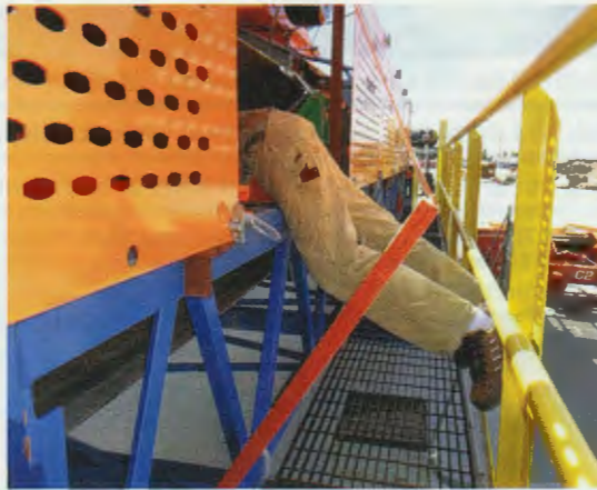
3 Never do this: confined space entry by untrained personnel is a formula for serious injury