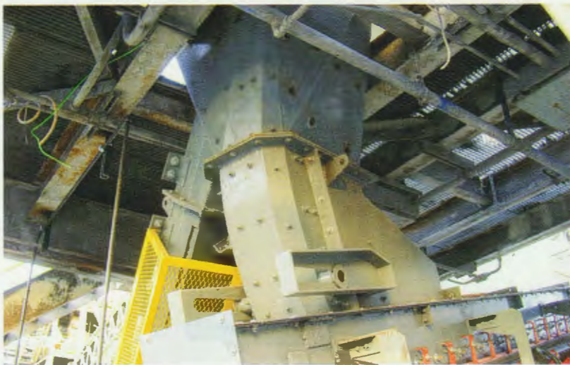
All Martin Engineering