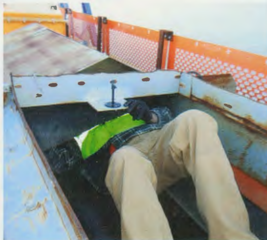
4 An estimated 7% of the U.S. fatalities recorded by MSHA between 1995 and 2011 occurred in a confined space