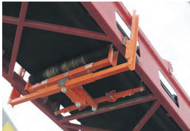
The Roller Tracker centers the cargo, reduces spillage and increases safety.