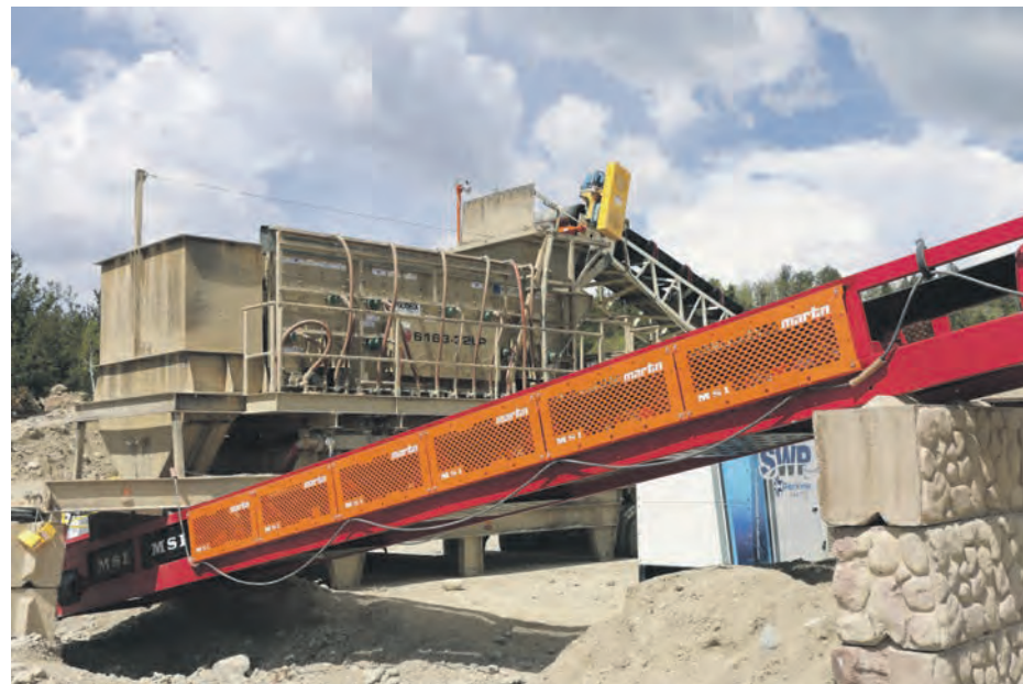
Modular conveyor guards protect workers from pinch points and other hazards.

Further safety enhancements included Martin Engineering conveyor guarding to protect workers from pinch points and other hazards. The modular guards allow workers to do their jobs with reduced risk and greater efficiency, while helping to ensure plant compliance with safety standards and regulations. The user-friendly design of the new guards is seen in standardized panels that take a systematic approach to guarding, with the flexibility to fit virtually any conveyor design. Wedge clamps allow the panels to be removed and reinstalled quickly and easily, so systems can be expanded or