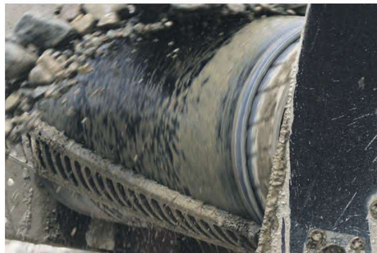
The CleanScrape design provides as much as 4x the lifespan of conventional belt cleaners.