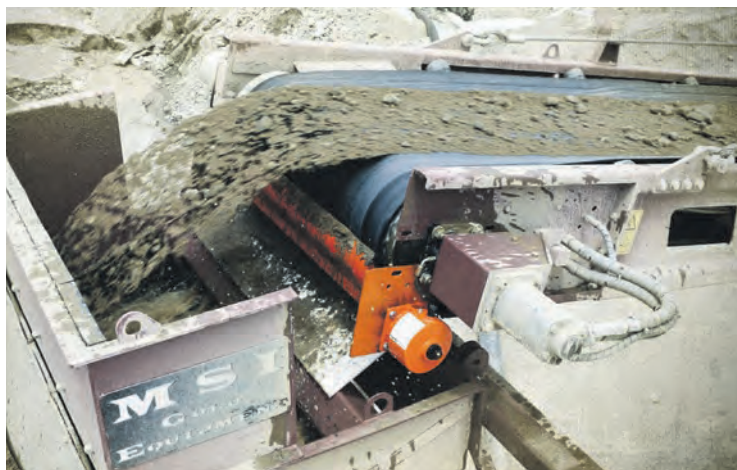
The heavy-duty primary belt cleaner can be replaced safely by one person in less than five minutes.

For more information, contact them at info@martin-eng.com or visit www.martin-eng.com , or call 800•544•2947.