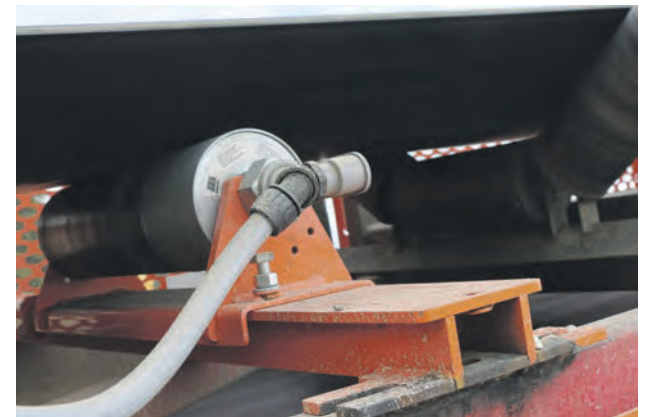
The Roll Gen system uses energy from the moving conveyor belt to generate power for lighting at night.