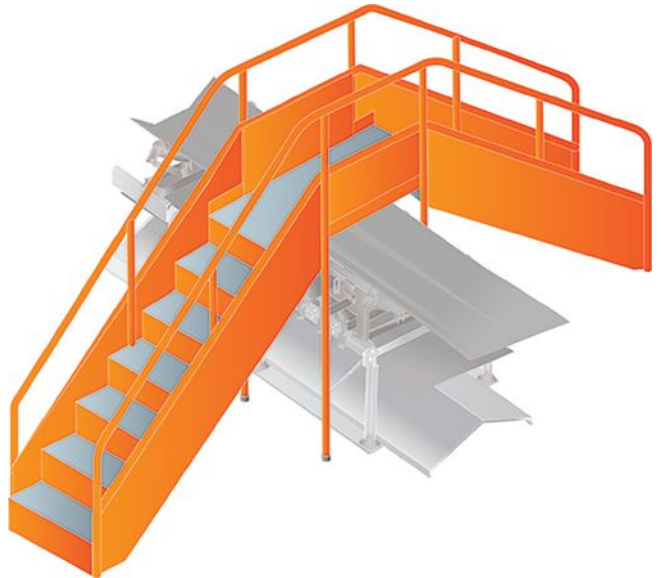
A designated crossover designed for that purpose is the only safe path to the other side.

a conveyor, this decision places the worker closer to the hazards of the conveyor.