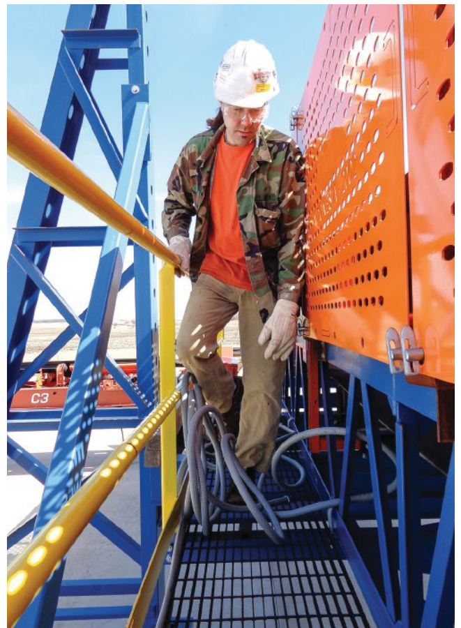
Obstructions such as discarded components, tools or spillage can cause a slip, trip or fall injury.