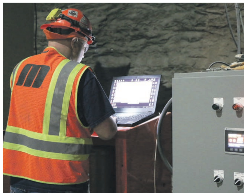
Integrating the system with the plant's PLC helps operators to monitor and adjust chemical outputs.

For more information, visit www.martin-eng.com or call 866•764•0197. Global representatives for Martin Engineering can be found at www.martin-eng.com/rep-finder .