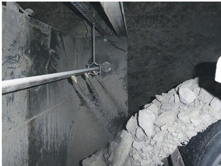
Spraying at the discharge allows the chemical additive to better penetrate the cargo stream.

The most common industry solution attempts to address particles released from normal operations, such as loading, unloading, wind and disruption of material, by using water for surface suppression. The goal is to wet the surface of cargo to promote cohesion of particles to prevent them from becoming fugitive airborne emissions.