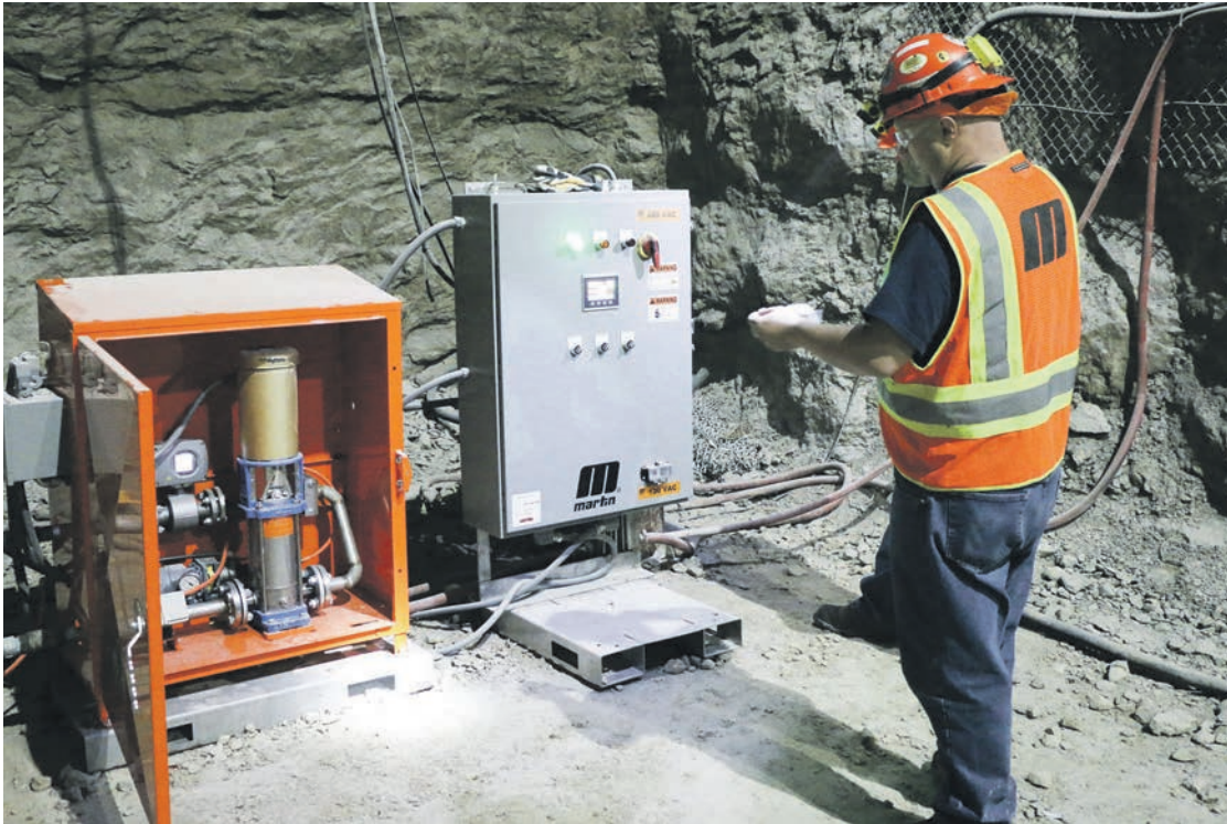
Monitors, valves and boosters are set in accessible cabinets, so the system is easy to inspect and maintain.