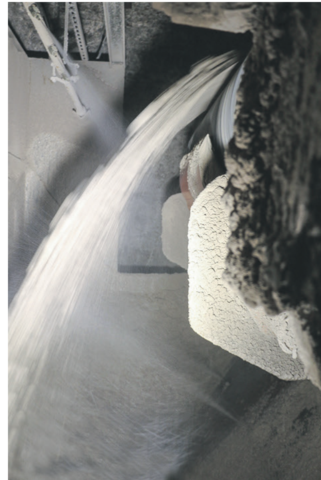
The dust management system treats the material from the top and bottom during discharge.

Small particles are released from normal operations, such as loading / unloading, transferring or crushing material. At 200 microns or less in diameter (200 micrometers), a particle can remain airborne and ride ambient air currents for long distances. At particle sizes less than 50 microns they become non-visible to the naked eye and can penetrate the body's natural defenses (cilia, mucus, etc.), entering deep into the lungs and potentially causing long-term health issues.