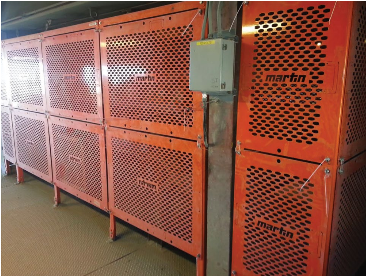
Guarding restricts access and may require a specific procedure to unlock.

According to industry expert R. Todd Swinderman, there are five root causes of conveyor injuries: a ‘production first’ culture, ‘low bid’ purchasing, overly complex designs, too many rules and understaffed/undertrained personnel. He pointed out, “A survey of the literature shows that companies who truly focus on safety are more productive, operate cleaner and safer facilities than their competitors, and have a higher share price.”