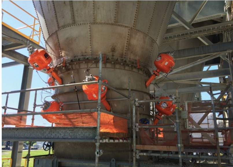
Air cannons are configured at a specific angle to enhance material flow.

visited all United States underground mines at least four times and surface mines at least twice in 2020. Between March 1 and December 31, 2020, MSHA issued 195 citations for coronavirus-related sanitary violations. Greater scrutiny saw the mining industry achieve all-time-low average concentrations of respirable dust and respirable quartz in underground coal mines, as well as reduced exposure to dust and quartz for miners at the highest risk of overexposure to respirable dust.