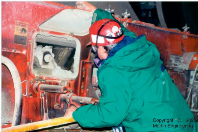
Detecting problems before they arise is at the core of PM & PdM.

Modern remote monitoring systems collect data and provide real-time status needed for PM and PdM. This data helps inform system efficiency improvements and avoid unscheduled downtime to reduce manual labor and ensure maximum performance. Monitoring systems are an essential component of making PM and PdM more effective.