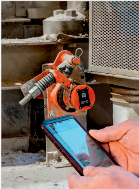
A Position Indicator delivers critical real-time intelligence on belt cleaners.

could lead to expensive belt damage. These systems also warn when the blade is no longer in contact with the belt due to wear, high temperatures, detachment or a pull-through condition, helping to prevent a catastrophic failure.