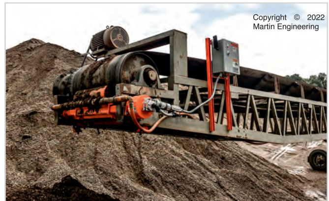
New designs can even control belt tensioning and pull the blade away from an unloaded belt.

New technologies are now evolving beyond monitoring to actually making system changes without human intervention, such as an autonomous belt cleaner tensioning system that continuously monitors and adjusts proper cleaner tension. The device ensures proper tension to optimize cleaning performance and reduce labor while improving safety and reducing the cost of operation. Prior to the new design, belt cleaner tensioners had to be monitored and adjusted manually, in some applications on a daily basis, so they would maintain optimum pressure and carryback removal.