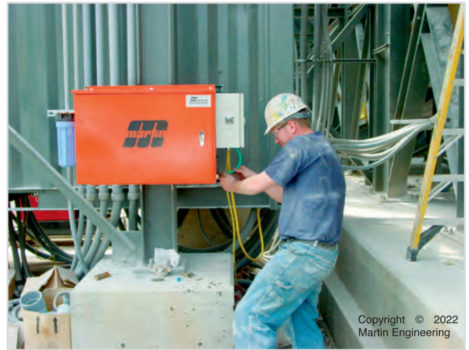
Sensors can send data to the cloud via Global System for Mobile Communications (GSM).

Of course, there is also the preventive factor. Sensors digest vast amounts of data and provide information to operators, allowing them to prevent major issues, rather than reacting to them. Wear parts like belt cleaners and aging idlers can be swapped out before problems related to idler seizure or cleaner pull-throughs can cause belt damage, mistracking or fires.