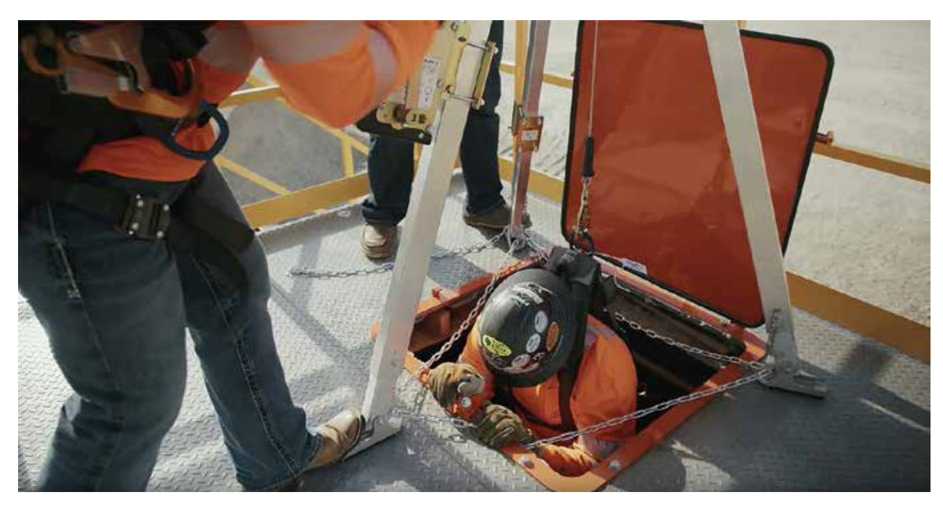
Confined space entry requires specific training since it is one of the most dangerous activities in bulk handling.