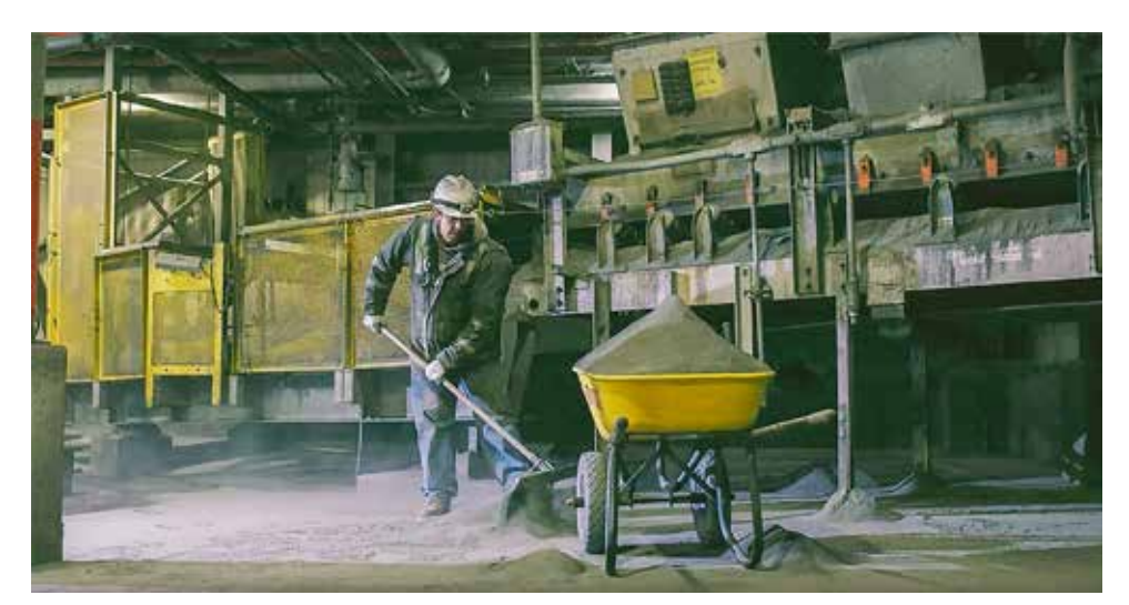
Some contractors only address the effects of conveyor inefficiency, while others offer solutions to remedy the root causes of inefficiency.

That's why Martin Engineering ensures its team of Martin Service Technicians (MSTs) are up to date on the latest techniques and bulk handling technologies by conducting regular, intensive weeklong 28-hour training sessions like the most recent one in the spring of 2024. MSTs who have been with the company for a few months to a few decades regularly receive refreshers on their existing knowledge and to learn about new products and practices.