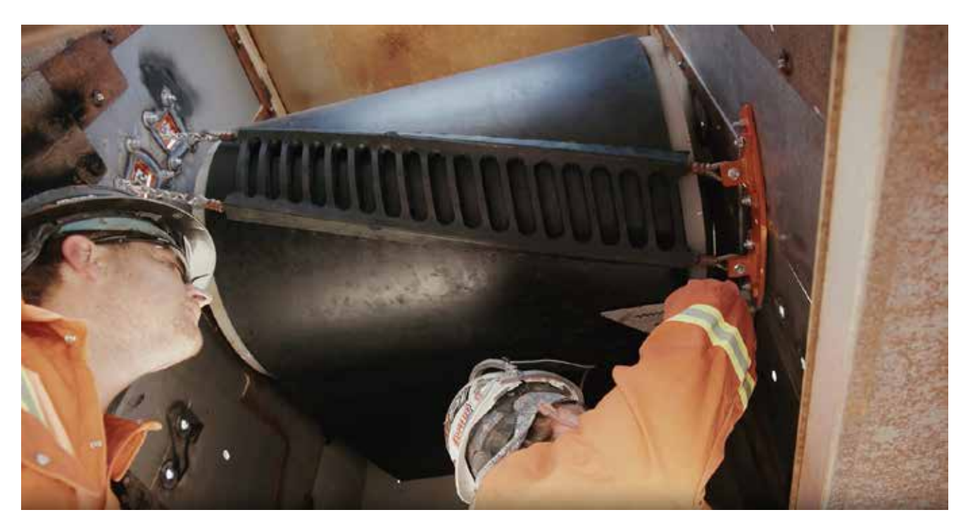
Innovative equipment like the CleanScrape have redefined what belt cleaner installation and tensioning looks like.

6) Provide a Walk the Belt™ report with photos tracking the project and any recommendations.