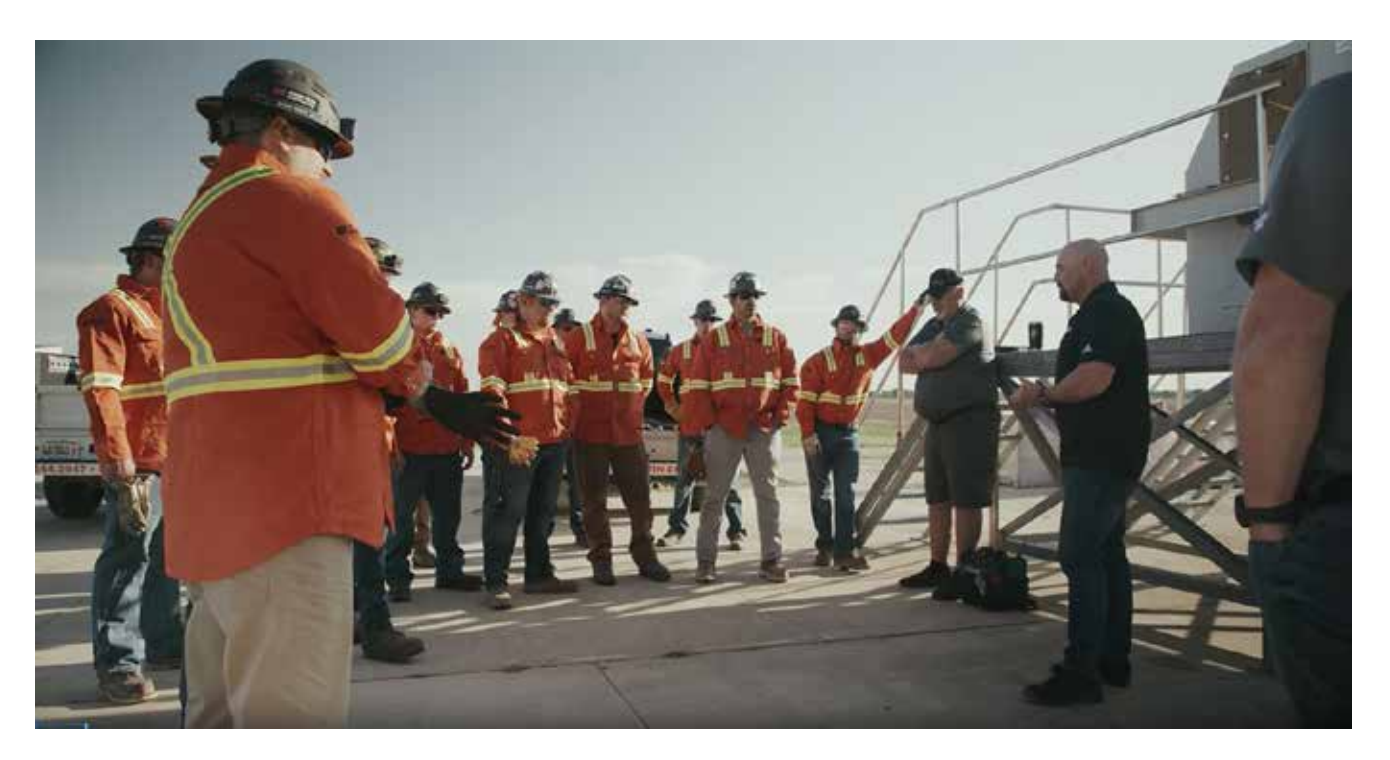
MSTs gather near a heavy-duty conveyor specifically set up for training purposes, ready to properly install new equipment.

From deep mines to large cement plants, the goal of the training is to ensure Martin's customers experience maximum efficiency and productivity in their bulk handling systems and are provided with the highest standard of service that complies with safe workplace best practices at every step.