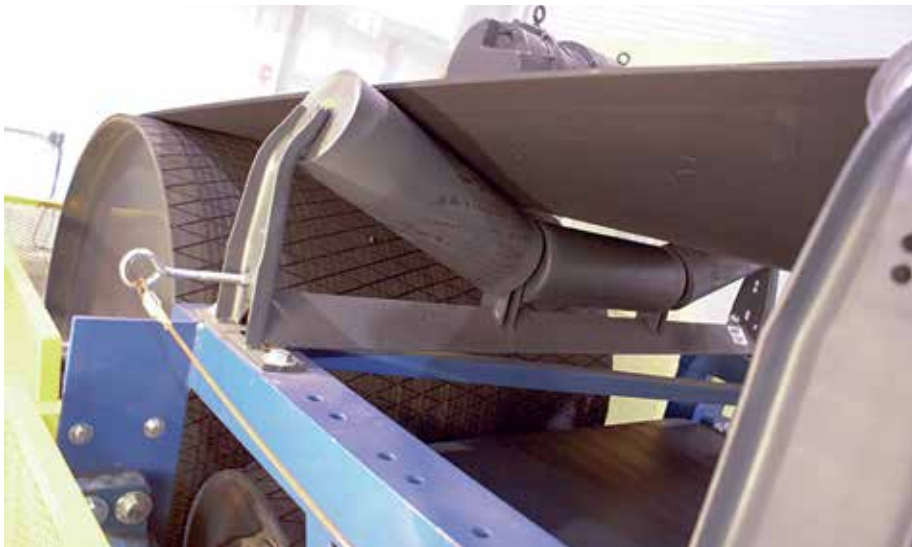
The pinch point between the belt and a carrying idler is one opportunity for an entrapment injury

“Using these new and emerging technologies, even poorly performing conveyors often don’t need to be replaced or rebuilt, but merely modified and reconfigured by knowledgeable and experienced technicians installing the right modern equipment,” Swinderman concludes. “Specialised conveyor training and trusted resources from global suppliers are helping to raise operator awareness to make conveyor systems cleaner, safer and more productive.” ●