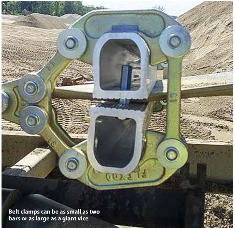
Belt clamps can be as small as two bars or as large as a giant vice

Airborne dust can cause numerous health risks, ranging from material build-up in the lungs to explosions. Categorised as either respirable or inhalable according to particle size, dry, solid dust particles generally range from about 1 to 100 microns ( \mu\text{m} ) in diameter. According to the EPA, inhalable coarse particles are 2.5-10 \mu\text{m} in size. They are typically caught by the human nose, throat or upper respiratory tract. In contrast, fine respirable particles (under 2.5 \mu\text{m} ) can penetrate beyond the body’s natural cleaning mechanisms (cilia and mucous membranes), travelling deep into the lungs and causing long-term or chronic breathing issues.