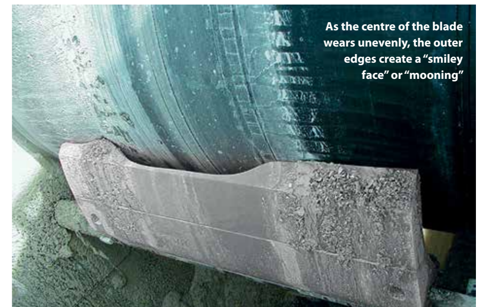
As the centre of the blade wears unevenly, the outer edges create a "smiley face" or "mooning"

Another potential source of wear is when the cleaner blade is wider than the material flow, causing the outside portion of the cleaning blade to hold the centre section of the blade away from the belt. As a result, carryback can flow between the belt and the worn area of the blade, accelerating wear on this centre section. Eventually, the process creates a curved wear pattern sometimes referred to as a "smiley face" or "mooning."