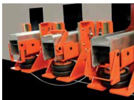
New air tensioners reduce labour

To overcome the problem of the blade angle changing as the blade wears, a radial-adjusted belt cleaner can be designed with a specially engineered curved blade, known as “CARP” for Constant Angle Radial Pressure. With this innovative design, the changes in contact angle and surface area are minimised as the blade wears, helping to maintain its effectiveness throughout the cleaner’s service life.