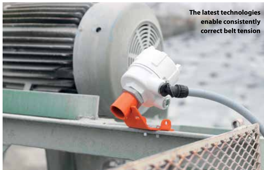
The latest technologies enable consistently correct belt tension

New air-powered tensioning systems are automated for precise monitoring and tensioning throughout all stages of blade life, reducing the labour typically required to maintain optimum blade pressure and extending the service life of both the belt and the cleaner. Equipped with