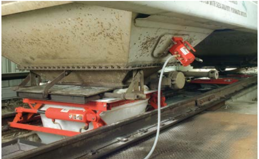
‘Hammer rash’ will actually worsen the problem that hammering was intended to overcome.

The device performs work when compressed air (or some other inert gas) in the tank is suddenly released by the valve and directed through an engineered nozzle, which is strategically positioned in the chute, tower, duct, cyclone or other