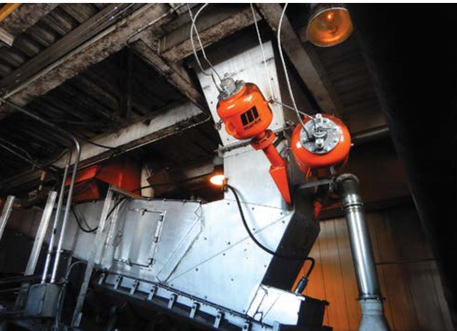
Air cannons deliver a controlled burst of compressed air to dislodge material buildup.

It's also important that any flow aid device be used only when discharges are