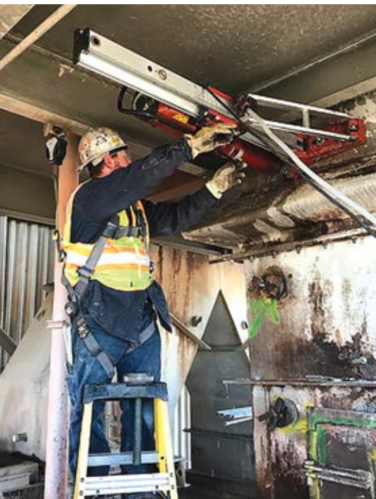
New technology allows air cannons to be installed and serviced without a process shutdown.

Flow aid devices deliver force through the chute or vessel and into the bulk material. Over time, components will wear, or even break, under normal conditions. Most of these devices can be rebuilt to extend their useful life. Because clearances and fits are critical to proper operation, it’s recommended that flow aid devices be rebuilt and repaired by the manufacturer, or that the manufacturer specifically train plant maintenance personnel to properly refurbish the equipment.