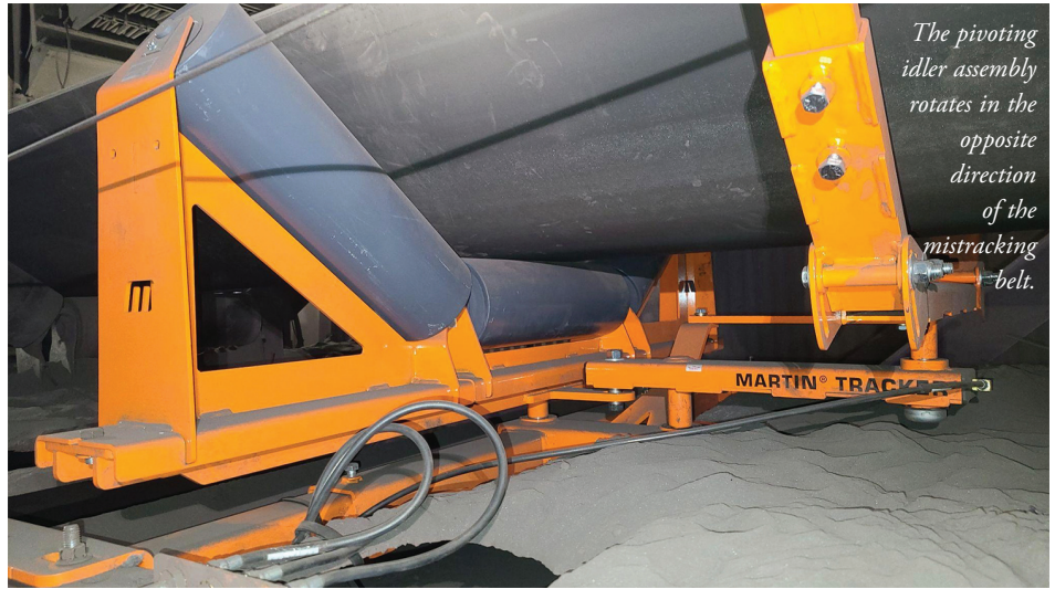
The pivoting idler assembly rotates in the opposite direction of the mistracking belt.

It is recommended operators install Martin Tracker HDs after the load zone on belts wider than 24in (610mm) with additional units placed down the system to keep the belt centred and tracking. By placing an