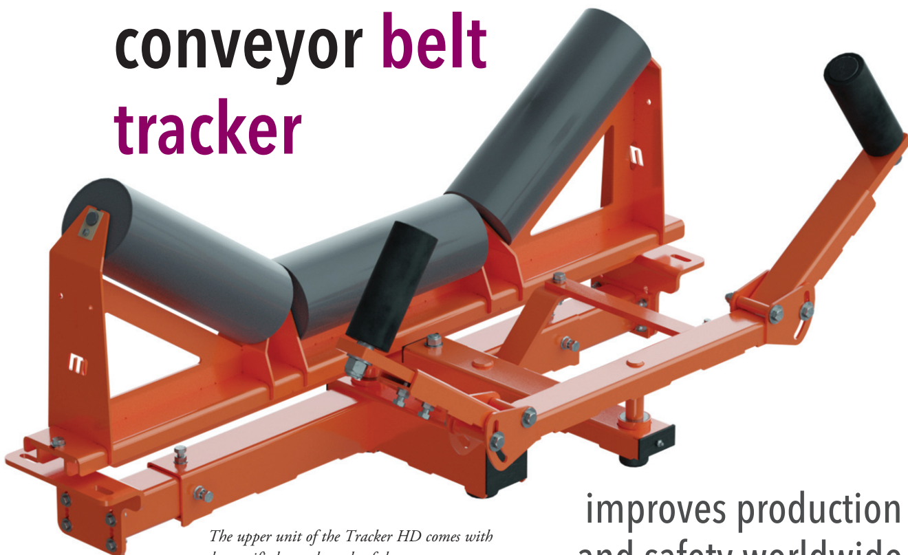
The upper unit of the Tracker HD comes with the specified trough angle of the conveyor system (all photos: ©2024 Martin Engineering).

improves production and safety worldwide