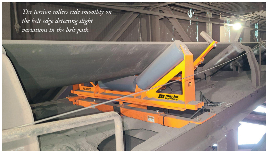
The torsion rollers ride smoothly on the belt edge detecting slight variations in the belt path.