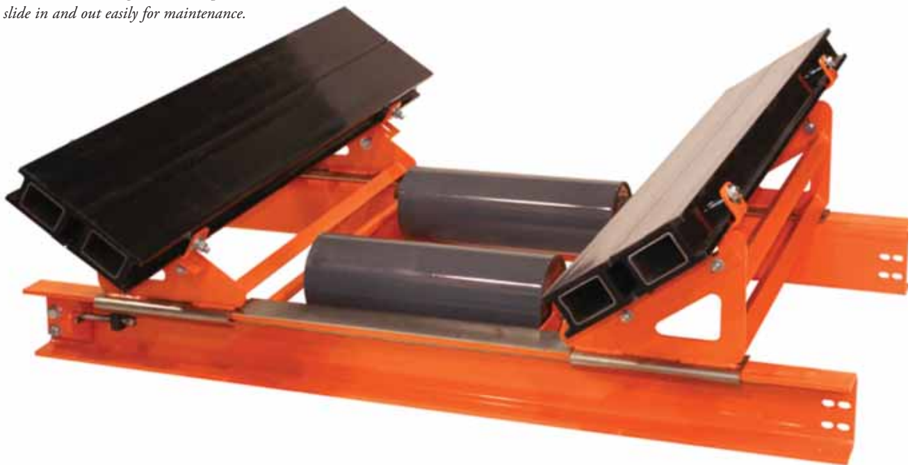
Track-mounted designs allow components to slide in and out easily for maintenance.

To reduce maintenance time and labour, improve safety and extend equipment life, operators should consider track-mounted impact cradles and belt support cradles. Located under the skirtboard and mounted with rugged steel assemblies, the cradles feature large impact-absorbing UHMW