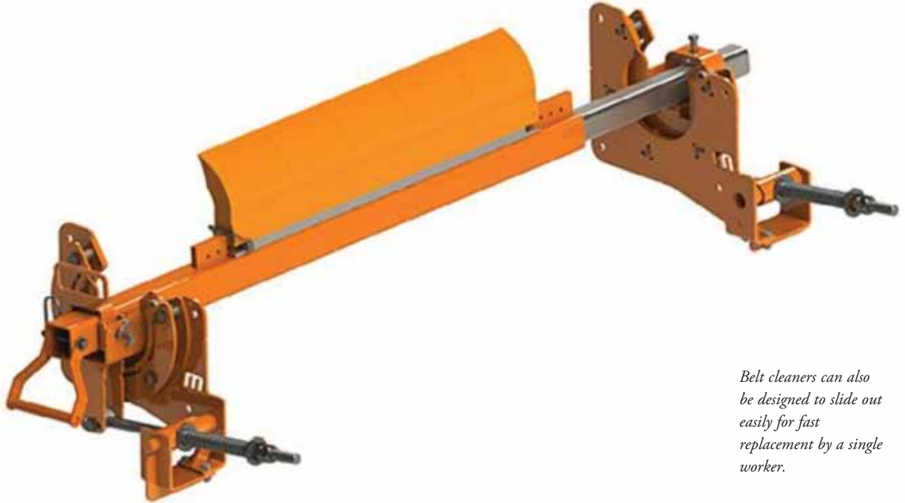
Belt cleaners can also be designed to slide out easily for fast replacement by a single worker.

spillage from escaping. A comparable solution was installed in the longer chute, with added cradle support down the entire length. Both chutes featured non-powered dust bag systems to collect emissions.