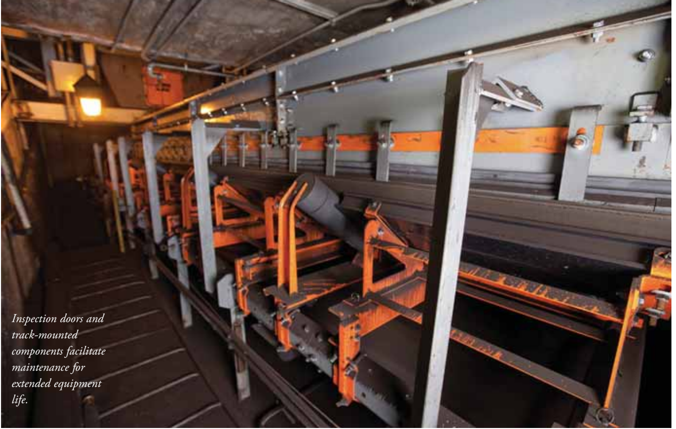
Inspection doors and track-mounted components facilitate maintenance for extended equipment life.

an ownership and management perspective, downtime and injuries affect profitability through loss of production, capital expenditures for new equipment and ongoing insurance implications.”