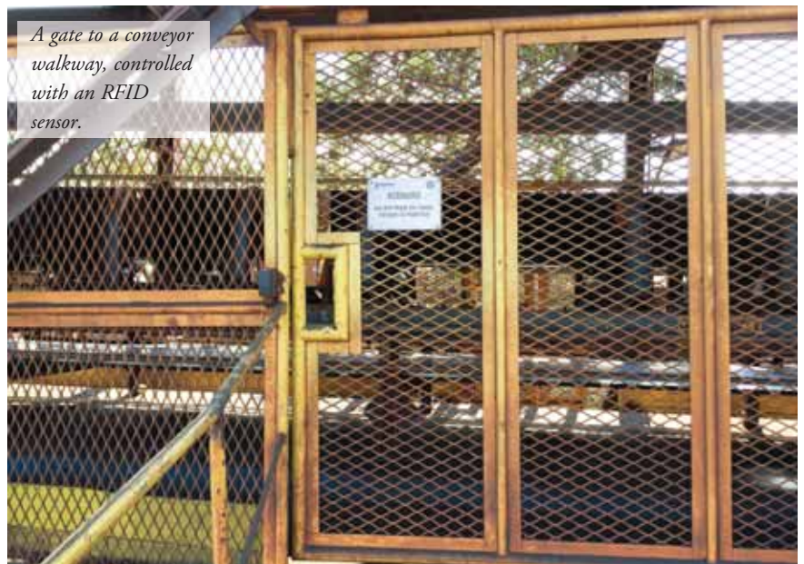
A gate to a conveyor walkway, controlled with an RFID sensor.