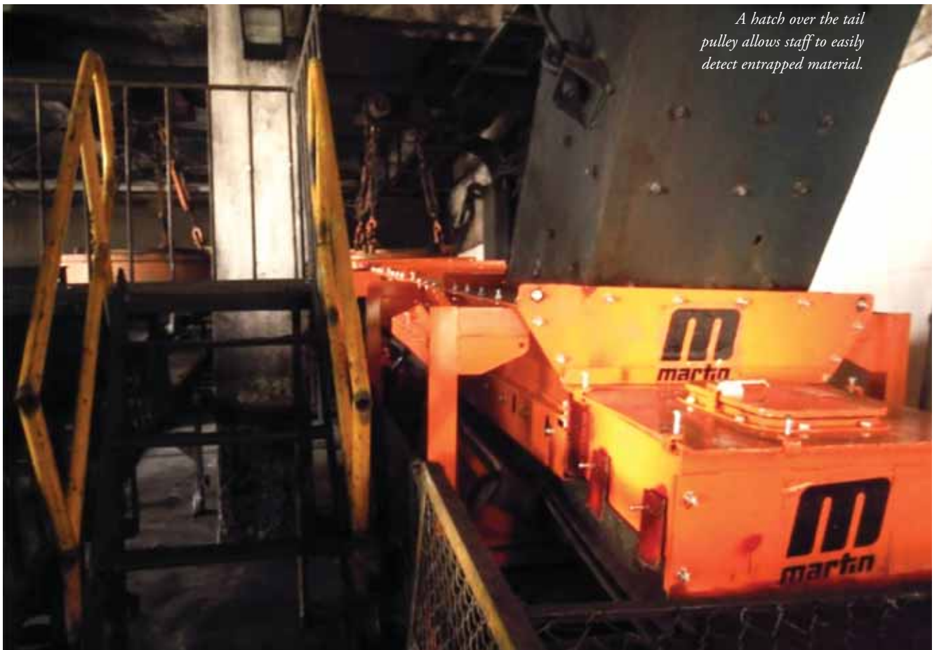
A hatch over the tail pulley allows staff to easily detect entrapped material.