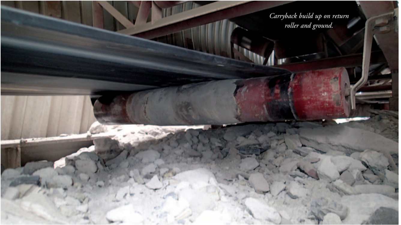
Carryback build up on return roller and ground.

Carryback is fine material that sticks to the belt surface or becomes lodged in the cracks and crevices of the carrying side of the belt. Carryback material collects on components that the carrying side of the belt touches and eventually dries out, dropping beneath the system along the return path. Accumulations tend to range from pyramid shaped piles of dry dust particles to puddles of muck.