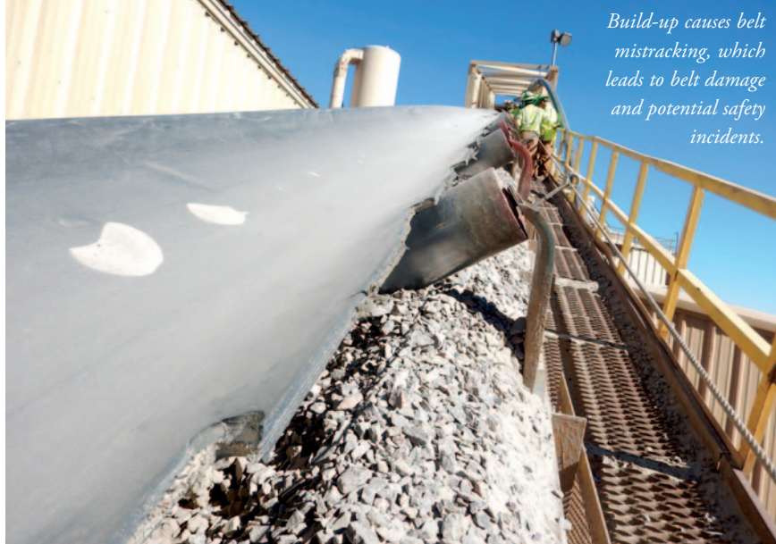
Build-up causes belt mistracking, which leads to belt damage and potential safety incidents.

There are additional hidden costs that are often overlooked when justifying improvements to control fugitive materials. Working in a dusty atmosphere reduces