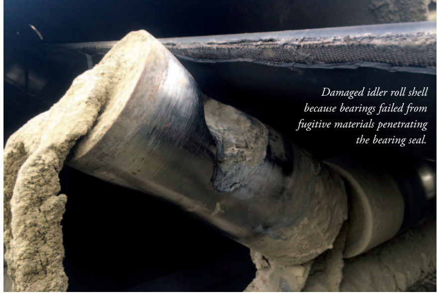
Damaged idler roll shell because bearings failed from fugitive materials penetrating the bearing seal.

The application of indicators such as belt wander switches, zero speed switches and plugged chute detectors has been practiced for as long as there have been conveyors. These devices are often purposely defeated due to false trips or other signals that interrupt production. The bulk material handling industry is starting to adapt sensor technology to the rigors of bulk material handling to better monitor conveyor performance and provide proactive warnings of problems that are developing. For example, wireless technology can gather data from numerous sensors without the need for hard wiring.