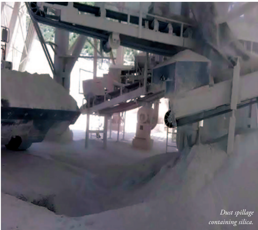
Dust spillage containing silica.