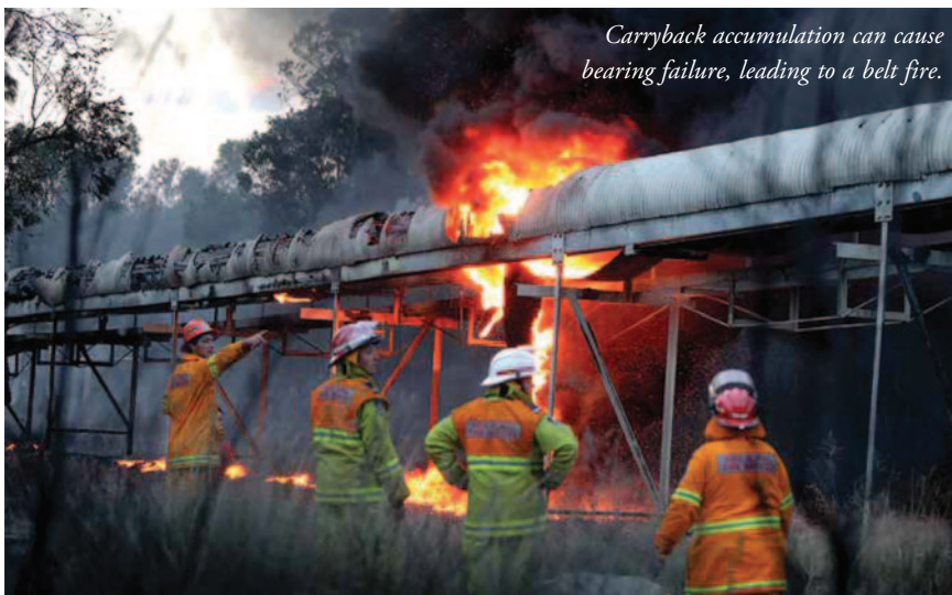
Carryback accumulation can cause bearing failure, leading to a belt fire.

Martin Engineering products, sales, service and training are available from 19 factory-owned facilities worldwide, with wholly-owned business units in Australia, Brazil, Chile, China, Colombia, France, Germany, India, Indonesia, Italy, Japan, Mexico, Peru, Russia, Spain, South Africa, Turkey, the USA and UK. The firm employs more than 1,000 people, approximately 400 of whom hold advanced degrees.