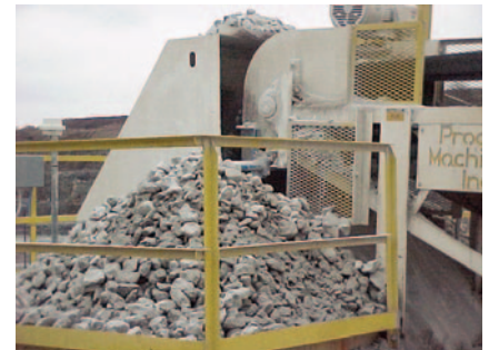
Spillage causing slip, trip and fall hazard.

particle sizes similar to the cargo. Piles of spillage can accumulate quite rapidly and can occur intermittently from plugged chutes, overloaded belts and mistracking or continuously from poorly designed or inadequately maintained transfer points. Inclined loading zones can also have material roll backward, causing spillage out