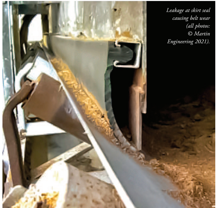
Leakage at skirt seal causing belt wear.

Spillage is cargo that escapes the belt, accumulating on either side of the conveyor and characterized by a range of