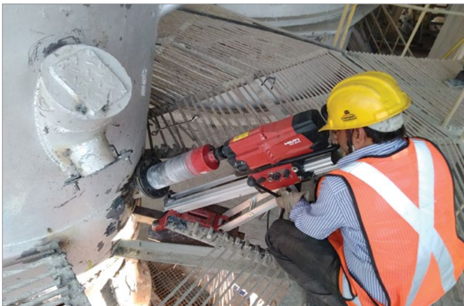
Core drilling during production by a trained technician.

The Chittor Cement Plant in Northwest India had considerable residue buildup in the kiln inlet and riser ducts of its preheater tower, and the manual cleaning schedule struggled to keep up. If left untreated, the accumulation would clog the duct and bring production to a halt in order to remedy the problem. To address the