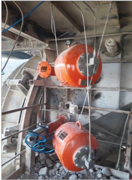
Two 70-liter cannons on Y-pipe assemblies, the bottom one fitted with retractable nozzle.

frequent replacement disrupted and degraded the refractory lining. Managers sought a safer, more sustainable solution that effectively removed the build-up.