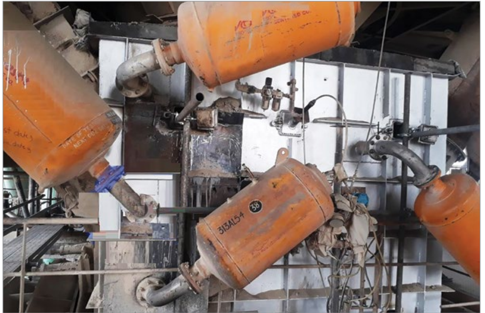
The old 150 L cannons with fixed pipe assemblies.

Operators discovered that the large tanks overtaxed the plant's compressed air system, without completely resolving the problem. As a result, they were forced to continue manual cleaning, losing valuable production time as workers in protective gear braved the unpleasant conditions. In addition, because of the abrasive high-heat environment, the fan jet nozzles failed quickly. Replacing the nozzles required certified workers to enter the confined space, resulting in excessive downtime, and the