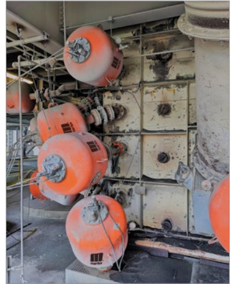
These air cannons are strategically located and fired in a specific sequence for maximum effect.

Today, design and engineering advancements are producing air cannons that are more compact and lighter, with greater efficiency and power. Suppliers are innovating the way they're built, installed, serviced and powered in order to maximize production and reduce both