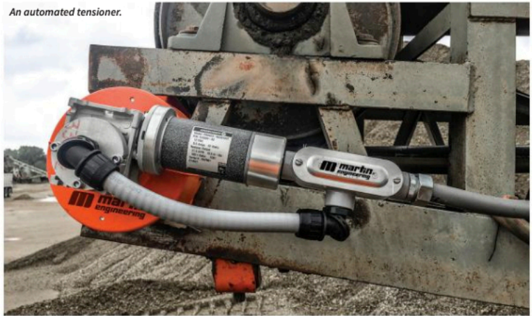
An automated tensioner.

roughly perpendicular to the belt surface, with the support frame and blade design providing the cleaning angle. Some designs incorporate a relief ability for impact by splices or belt defects.