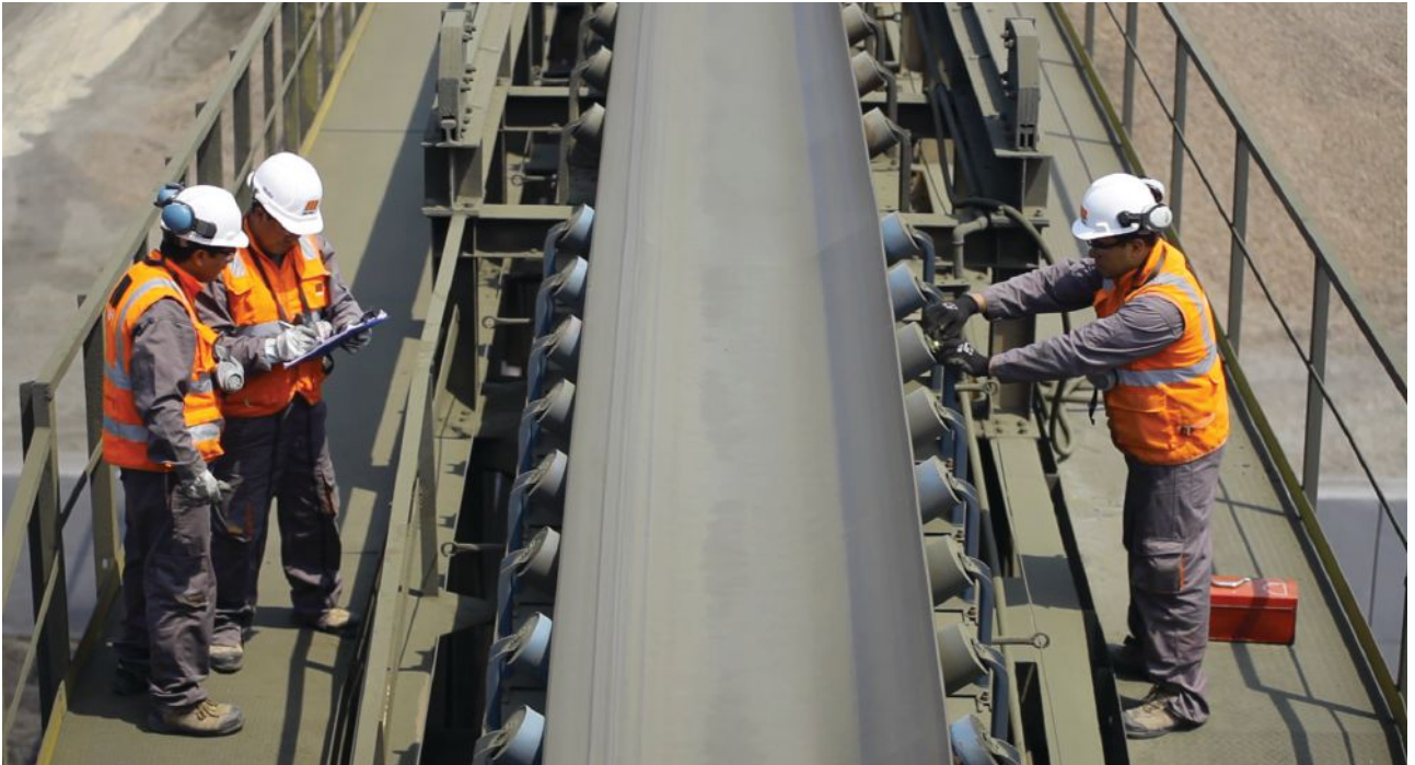
Obstructions such as discarded components, tools or spillage can cause a slip, trip or fall injury.