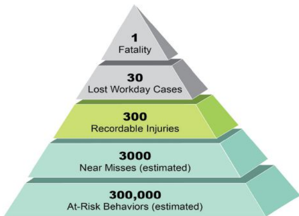
The most effective way to reduce fatalities is to minimise unsafe behaviors.