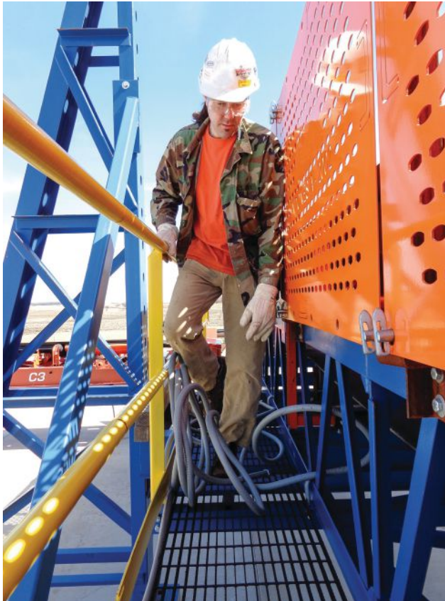
Conveyor service should be performed only when the belt is properly locked, tagged, blocked and tested.

Because of their size, speed and high-horsepower drive motors, conveyors pose a number of risks to personnel working on or near them. In addition to all of the physical danger zones, when an injury occurs, “fault” is often attributed to injured workers’ actions or inactions. However, safety experts point out that injuries generally occur due to a series of factors.