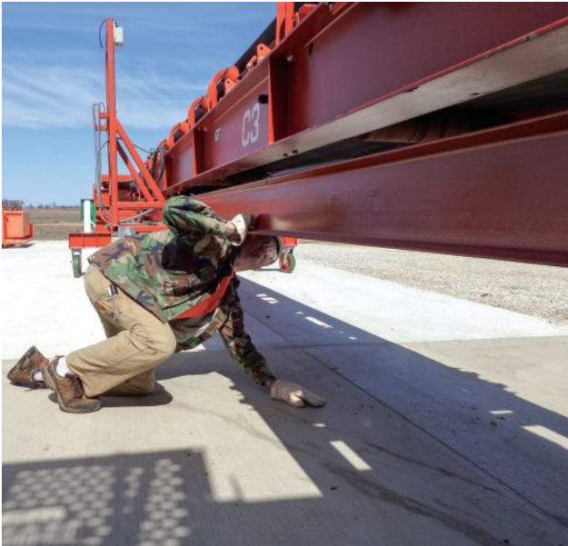
Taking a shortcut by crossing over or under a conveyor can lead to injury.

The most common of these workarounds involves the improper locking out of a conveyor system. The purpose of a lockout is to de-energise all sources of energy, whether latent or active. Failure to properly lockout can exist in many forms – varying from disregarding lockout requirements, to working on a moving conveyor, to improperly stopping the conveyor. An example would be pulling the emergency-stop cord and assuming that the conveyor is de-energised.