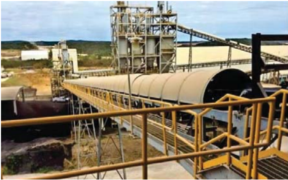
The covered D-07 conveyor transfers material from tower to tower.

The Hunter Cement Plant in New Braunfels, Texas - owned and operated by Martin Marietta - reports annual production of 2.3 million TPY (2 million MTPY). The facility was experiencing transfer chute clogging and conveyor belt backups from wet fines and aggregate on its partially-covered D-07 conveyor. Heavy seasonal rain caused serious spillage issues and accumulation in the chute, which halted plant production. When the material flow ceased, 2-3 workers used air lances and pneumatic jackhammers fitted with 8-foot long bits, which required 6-8 hours to clear the obstruction, posing a potential workplace hazard and increasing operating costs.