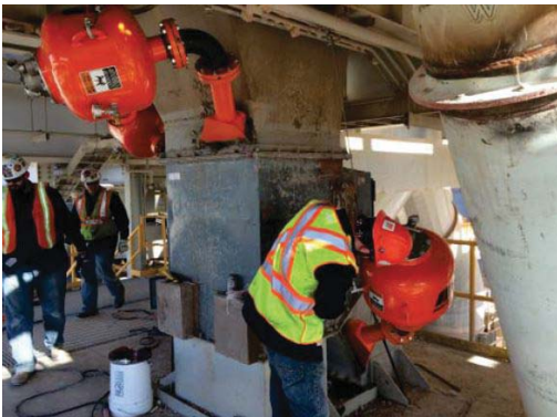
Mounted down three levels of the chute, workers have good access to the cannons for easy maintenance.

Six months after the installation, plant managers report that the air cannons have significantly decreased the clogging and backup issues, resulting in continuous operation with minimal unscheduled downtime. The area around the chute now only needs routine cleanup and maintenance accompanying normally scheduled inspections. "We were confident that the Martin team was going to come through," Martin Marietta management concluded. "Like their other cannons in the plant, the equipment has worked out well. With the team's consistently attentive service, this has turned out to be a good solution."