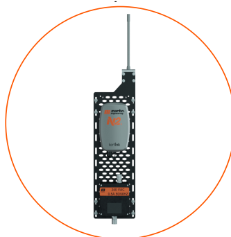
N2® Cellular Gateway