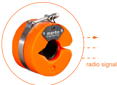
N2® Position Indicators