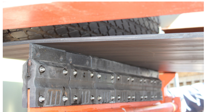
Fig. 1 - Hand Cradle