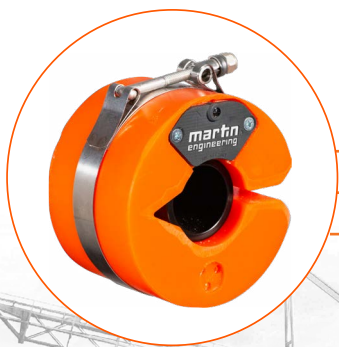
N2® Position Indicators