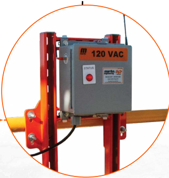
N2® Cellular Gateway