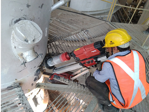
Holes are drilled at approximately a 30° angle to support the flow of material.

LOCATION: JK Cement Works, Nimbahera, Rajasthan, India