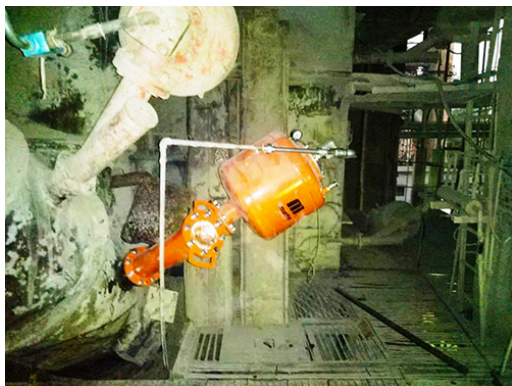
The 70L Martin® Typhoon Air Cannon dislodges accumulation over a large area.