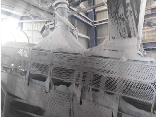
Fine dust would easily escape through openings in the enclosure, filling the area and settling on surfaces.

LOCATION: Kazan Soda Elektrik Uretim A.S., Ankara, Turkey