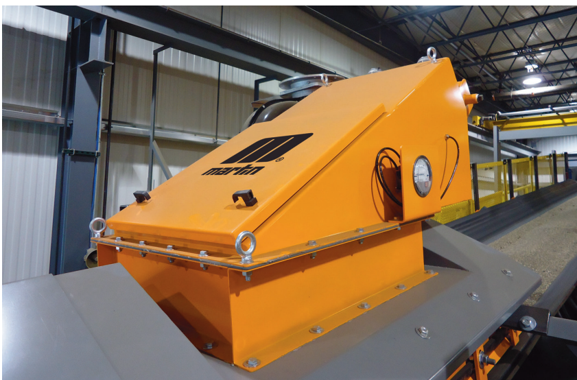
Integrated air cleaner installed.

analysed and the duct appropriately sized to maintain the velocity in every branch.