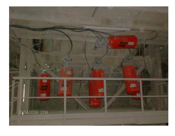
Technicians from Martin Engineering Turkey installed a battery of 31 Martin® Air Cannons