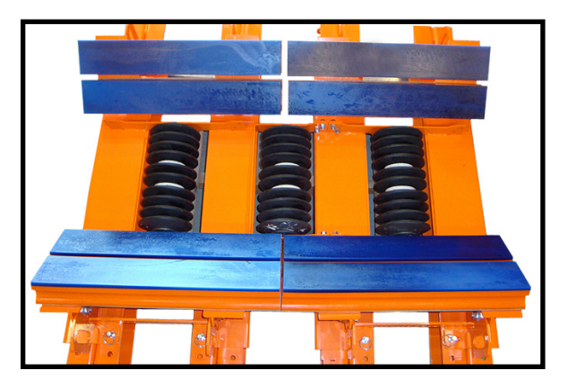
Note: When installing two impact cradles with center rolls back-to-back order Roller Cradle Roller Kit, P/N UC-001670-XX