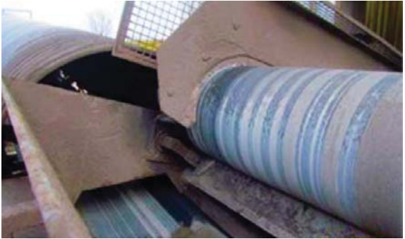
Inadequate cleaning reduced system productivity and increased maintenance costs.

After a thorough inspection that included a Walk the Belt assessment, Martin Engineering Germany representatives determined that a QC1™ Cleaner HD STS was better suited to clear the belt of adhered carryback. Using the patented Martin® Tensioner HD STS with a polyurethane blade formed in the "CARP" (Constant Angle Radial Pressure) design, the blade creates a tight seal on the belt, flows easily over the splice and maintains cleaning performance through all stages of blade life. Mounted on a sturdy stainless steel mandrel, the blade cartridge is serviced without confined space entry with a simple one-pin operation, making replacement a safe and simple procedure.