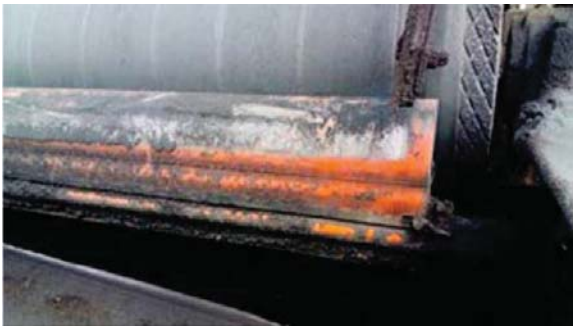
Improved belt cleaning increased efficiency and reduced airborne dust.

Upon installation, operators discovered considerably more material was discharging into the chute with less carryback. Due to the reduction of material adhered to cracks and divots on the return side of the belt, less dust adhered to the belt, leading to an immediate improvement in plant air quality. Spillage along the belt path was also significantly reduced, leading to fewer workers taking less time to clean along the belt path, improving safety and reducing the cost of operation. "We have not had to replace the belt once since installing the QC1™," said an operator close to the project. "We are now assessing the effectiveness of other cleaning systems compared to this one."